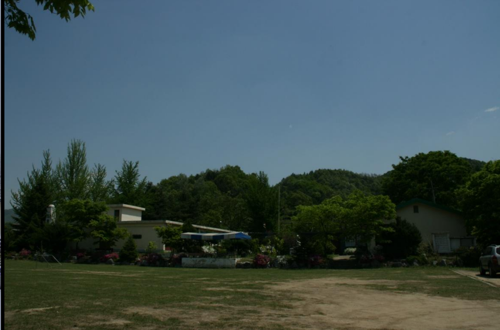
at front side