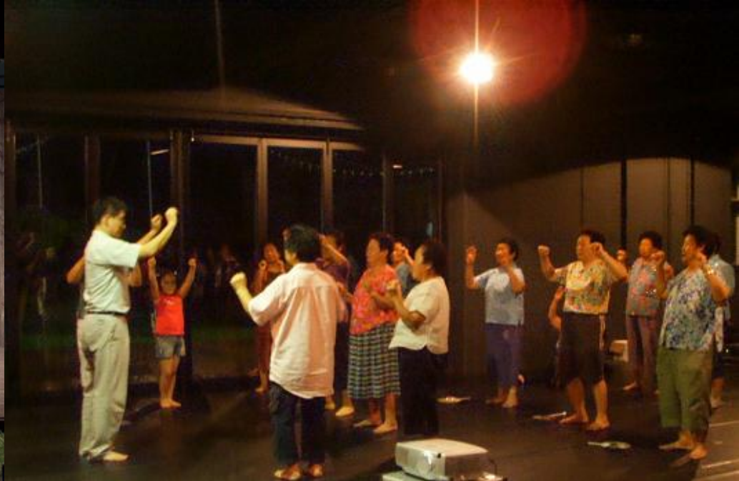
One's parent's generation