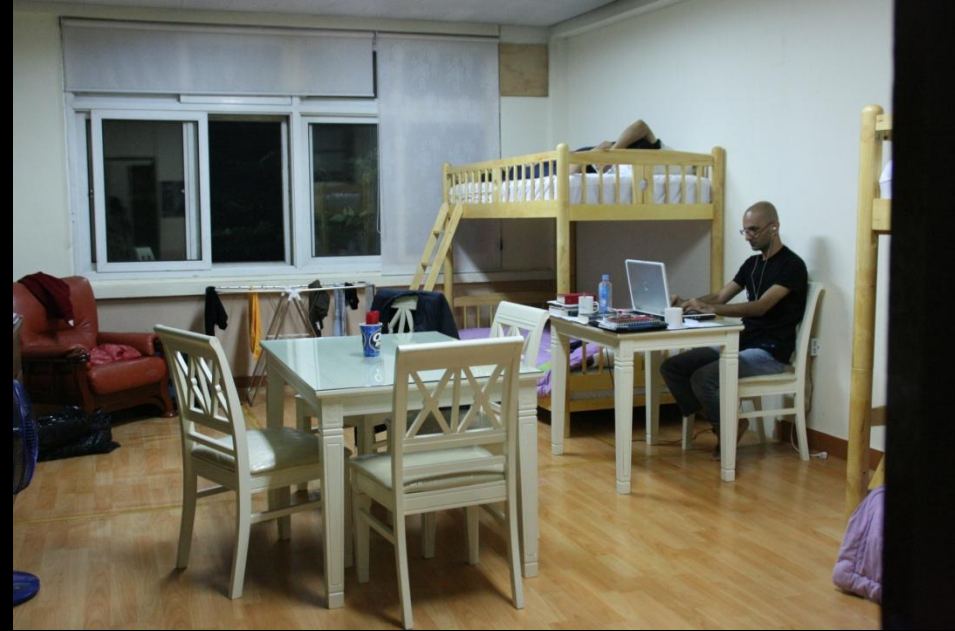
Room for residency artists