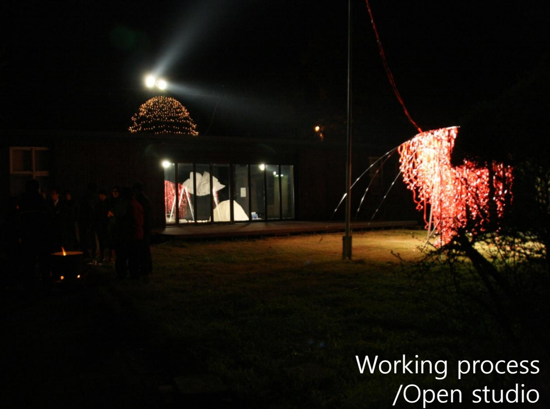
Working process /Open studio