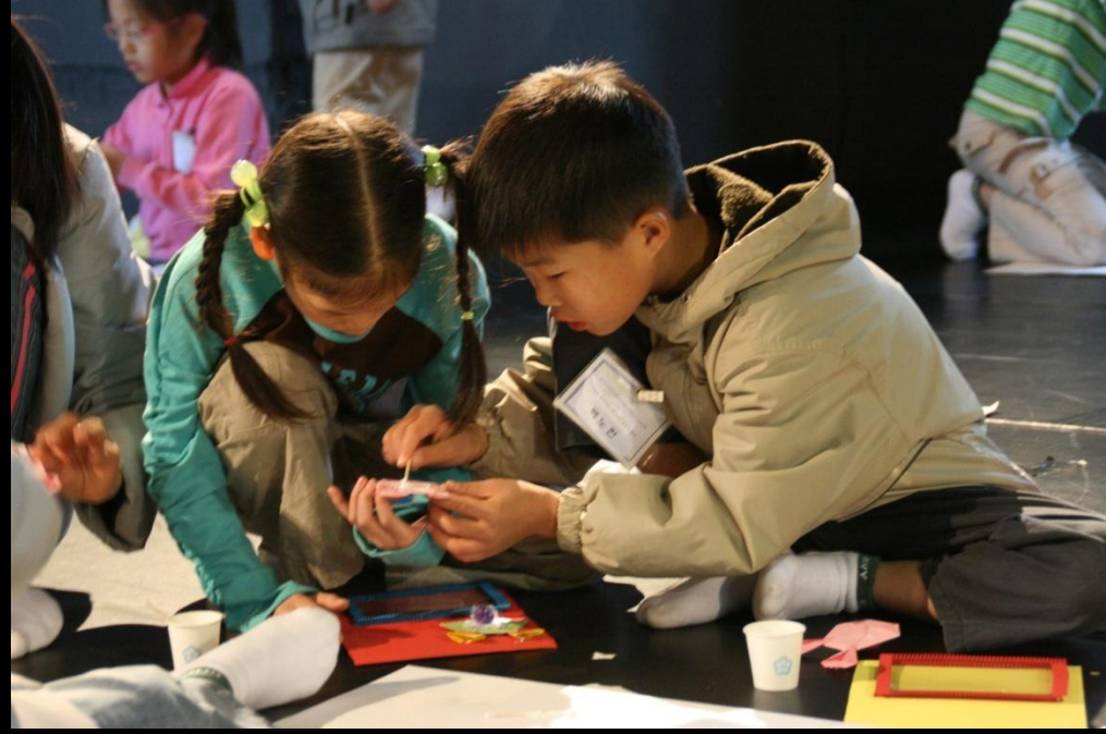
the younger generation